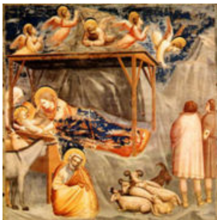
Natività di Gesù Giotto di Bondone (c.1267–1337))